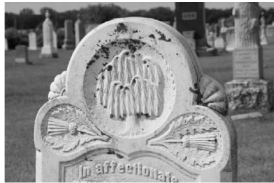
Weeping willow with thistle

Although the form of the weeping willow tree suggests grief and sorrow, in many religions it also suggests immortality. In Christianity it is associated with the gospel of Christ because the tree will flourish and remain whole no matter how many branches are cut off. The willow and urn motif was one of the most popular grave decorations of the late eighteenth and early nineteenth centuries and was often combined with other cemetery symbols like the lamb and crosses.