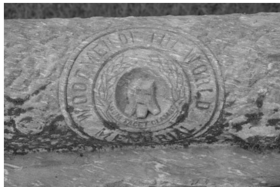
Woodmen of the World

The Woodmen of the World was founded in Omaha, Nebraska in 1890 by Joseph Cullen Root, and originally was open only to men aged between 18 and 45 who were not involved in hazardous professions (like gunpowder factory employees, train brakemen, bartenders, baseball players). The group was a small one compared with others, but one of best represented in cemeteries – and that's because until the 1920s it provided every member with a tombstone. At first the designs were supplied to local manufacturers but eventually the group allowed local firms to use any number of forms and designs as long as the Latin words Dum Tacet Clamet (Though silent, he speaks) were included.