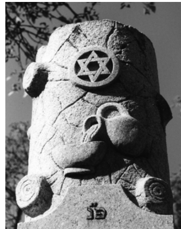
Star of David and Ewer

The bird appears on the gravestones of many women.