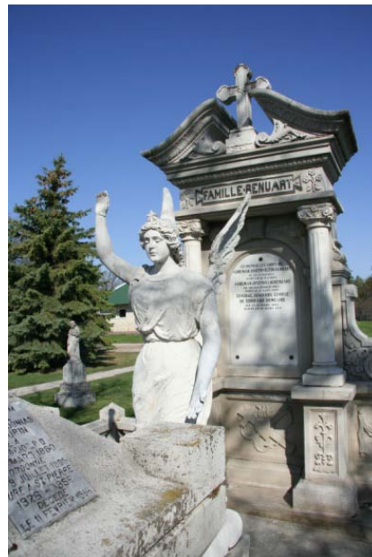
A family site at the St. Pierre is an exuberant example of Classical styling.