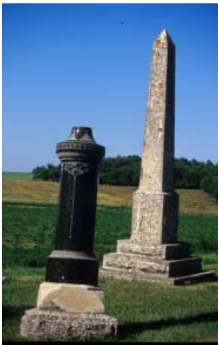
A granite column and limestone obelisk