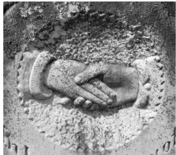
Hands Together/Clasped Hands