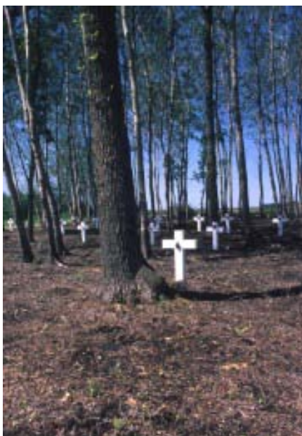
A small wooden cross