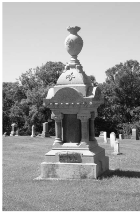
A major composite stone