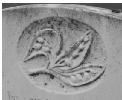
Buds and Seedpods

Buds and seedpods remind us of the fragile beginnings of life; these images almost always decorate the grave of a child.