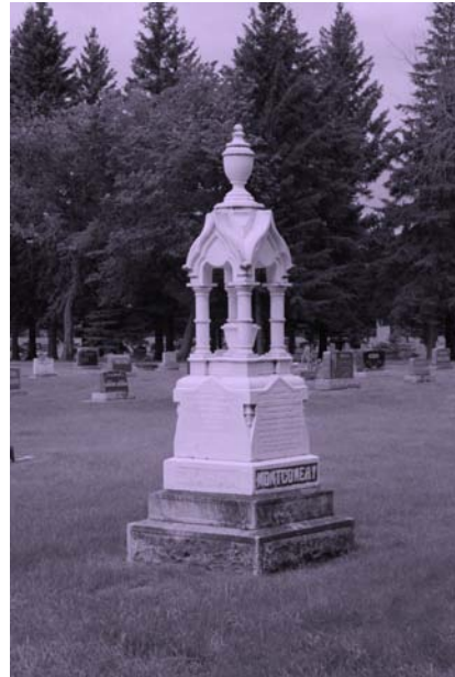
A gravemarker at Virden Cemetery is one of the finest examples of Gothic Revival styling used on a Manitoba stone.

Interestingly, there are few Manitoba examples where the two styles are explicitly and ambitiously explored. In most cases there will be an element or feature of detail lifted from the respective canons and placed for effect.