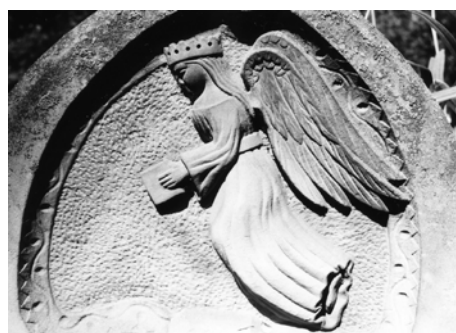
Two examples of angel sculptures