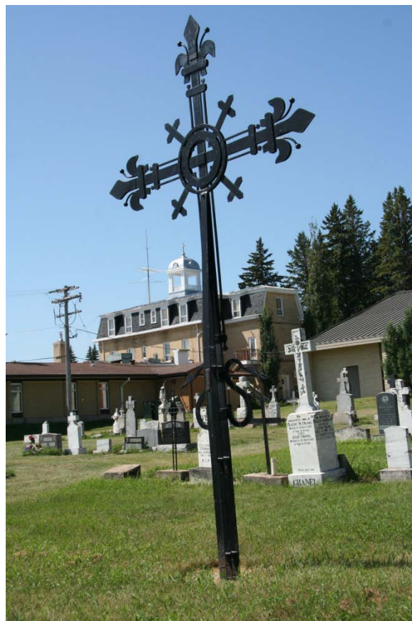
An elaborate Latin cross, of iron, common in Franco-Manitoban cemeteries

shaped cross, and who is thought to have brought Christianity to Russia.