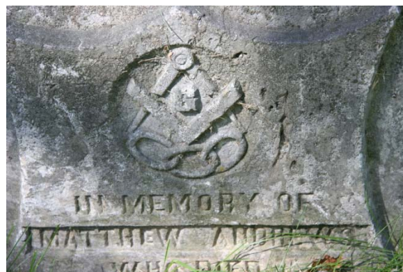
Tell-tale Freemason gravemarker symbols

master builder Solomon) is the square and compass, often with the letter G, which is thought to stand either for geometry or God. Sometimes a stone will also feature clasped hands and in this case the square and compass are thought to represent the interaction between mind and matter and refer to the progression from material life to intellectual and spiritual realms. Some markers also contain the all-seeing eye, often with rays of light. They are rare here, but if you come across the letters HTWSSTKS arranged in circle within a keystone you are likely standing before a grand master (the letters abbreviate the phrase “Hiram The Widow’s Son Sent To King Solomon”). Some Manitoba stones also feature specific information on the Mason’s position in the organization, with references to their Masonic degrees and attributes.