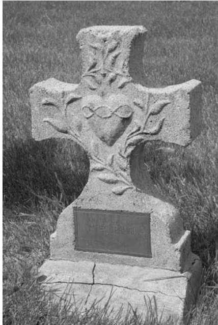
Vine, with heart

The vine is a powerful Christian symbol underlining the relationship between God and man.