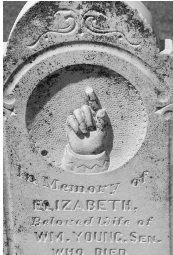
Hand Pointing Up

In the Victorian age the shaking of hands was a symbol of matrimony. Look closely at the sleeves on each arm – one should appear feminine and the other masculine. If the sleeves are gender-neutral then it is more likely that the image suggests heavenly welcome or earthly farewell.