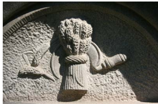
Wheat, with scythe

A sheaf of wheat can be used to denote someone who lived a long and fruitful life of more than 70 years.