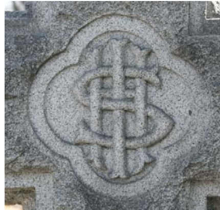
Two examples of IHS lettering