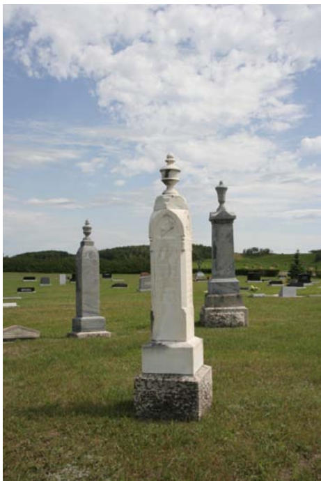
A collection of tower stones