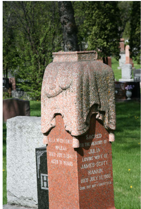
Curtain, Veil combined with a closed book