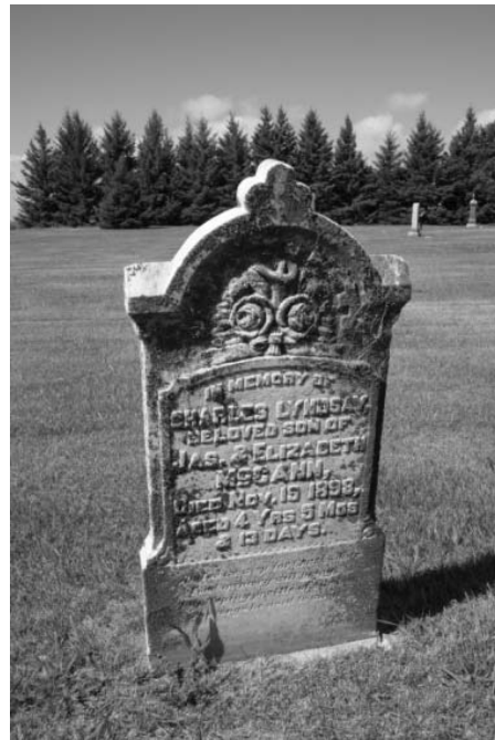
An elaborate tablet-style marker at High Plains Methodist Cemetery.

The Victorian period, which saw a dramatic interest in all things deathly, saw a welter of new gravemarker types and shapes. Ancient texts and images were mined for meaning and new symbolism. Hence the popularity of obelisks (a decidedly un-Christian symbol), dead trees, arcopogi, tables, chairs. There also arose interest in family groupings – a large family stone surrounded by smaller ones for each member. Large sculpted figures also came to be used on the most expensive markers.