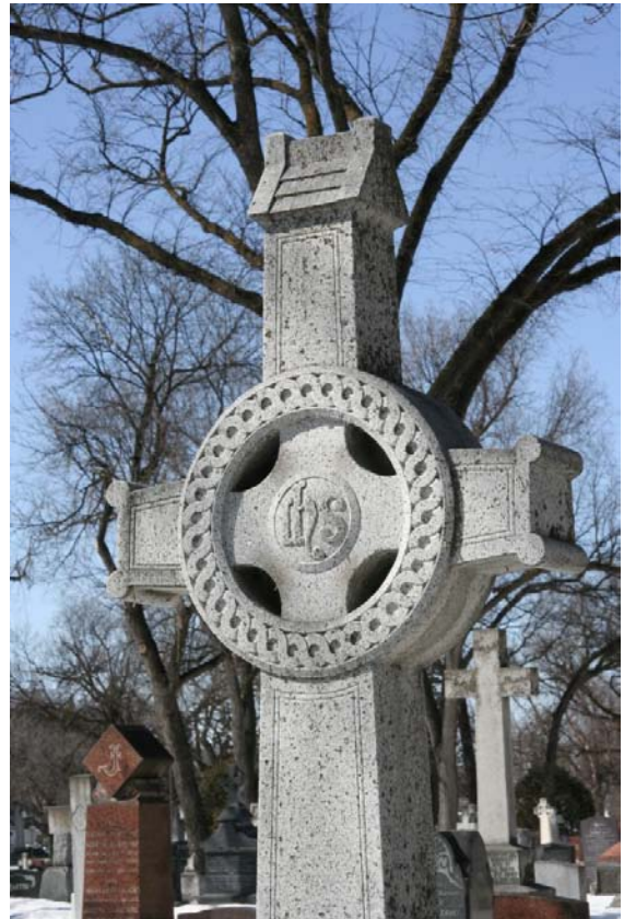
A Celtic Cross

The Celtic Cross is pagan in origin, predating Christianity by a number of centuries, but its two constituent parts were readily adaptable to the new faith. The pagan form featured a cross shape—representing male reproduction—enclosed within a circle, representing female reproductive power. As the Celts began to convert to Christianity in the 5th century AD at the lead of St. Patrick, the shapes were adjusted, so that the cross shape got larger and the circle smaller. The Celtic Cross is one of the most effervescent of forms in a cemetery—and given its Celtic roots it typically marks those of Irish or Scottish ancestry—its tall, slender form topped with the cross and nimbus, and also often writhing with the kind of intricate tracery and symbolism associated with Celtic culture.