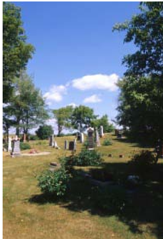
Gravemarkers at Cypress River Cemetery.

There are, according to the Manitoba Genealogical Society, more than 30,000 cemeteries in Manitoba. Many of these are small plots containing the remains of a pioneer family. There are, however, at least 1,000 graveyards large enough to sustain a high level of community interest.