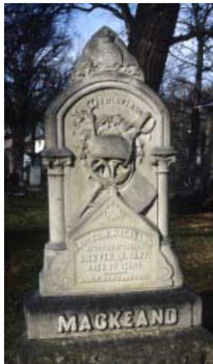
An enormously elaborate marble tablet