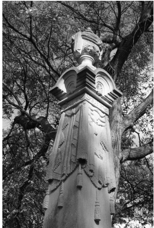
A Manitoba gravemarker loaded with Victorian-era symbols

It is important to keep in mind that the selection of these symbols on a gravemarker were often carefully considered – used to sum up and express a life.