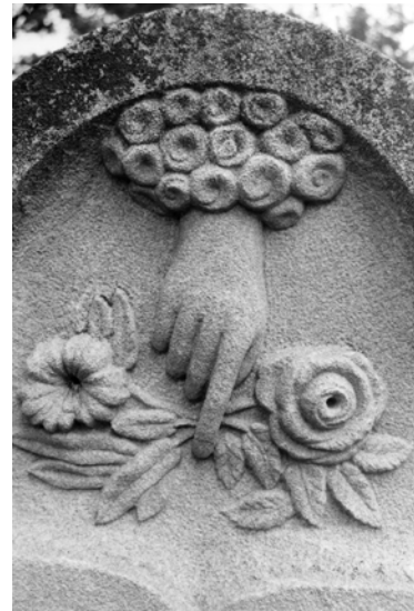
Roses, a daisy and a hand

The Queen of Flowers is an ancient symbol, suggesting longevity and beauty. In Christianity the rose is associated with martyrs and purity. The rose is usually found on women's gravemarkers.