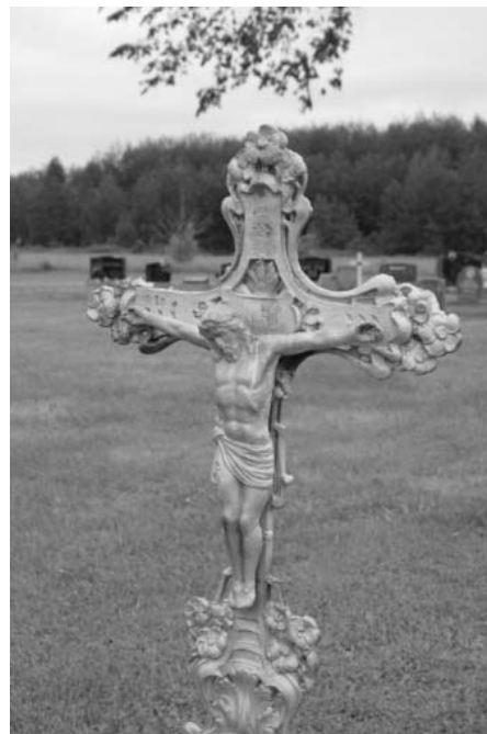
A very fine Christ on the Cross marker at Ste. Genevieve Cemetery.