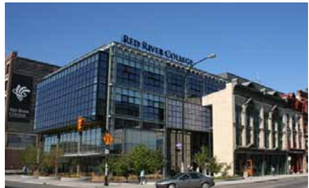
Red River College (Exchange District Campus), Winnipeg, MB Adaptive Re-use. The facades of heritage buildings along Princess Street are re-purposed for the new complex rather than demolished.