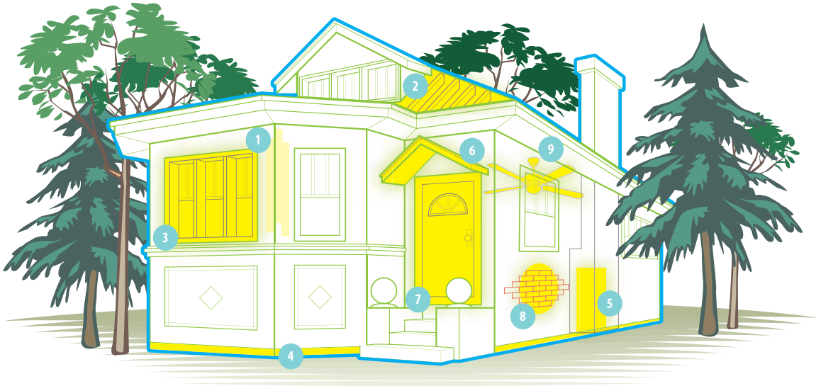
Illustration by mckibillo. Used with permission.

Energy efficiency upgrades to historic buildings should begin with the simplest and least expensive retrofits offering the highest potential for saving energy. With historic materials and systems, a typical “one-size fits all” approach may not be possible. Solutions adapted for the situation may be required. If necessary, contact professionals in historic conservation (ex: architects, engineers and mechanical contractors) for help.