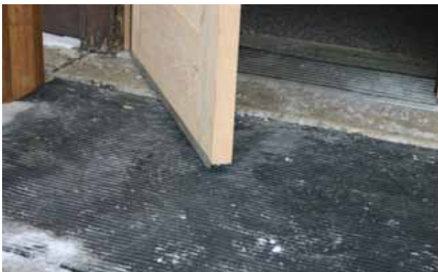
Former CPR Station, Portage la Prairie, MB. Adding weather-stripping to the refinished door provides a weather tight seal.

For more do-it-yourself information, see Manitoba Hydro's Power Smart Sealing, Caulking and Weatherstripping information booklet at www.hydro.mb.ca ; or call Manitoba Hydro at 1-888-MBHYDRO (1-888-624-9376) for a copy.