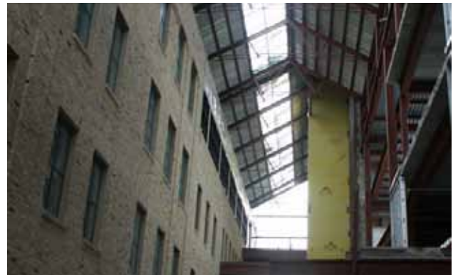
Red River College (Princess Street Campus), Winnipeg, MB The historic lane is preserved as a glass atrium between the two buildings. New and old technologies work together to achieve excellent energy efficiency for the building.

Although care must be taken, there are many improvements and retrofits that can work well in older heritage homes and commercial buildings. This guide will help building owners make informed decisions about which, if any, ecologically friendly changes to make and when to make them. The benefits of the suggestions in this guide are not limited to reducing ecological footprints . They also help preserve our heritage by extending the lives of buildings, while saving money.