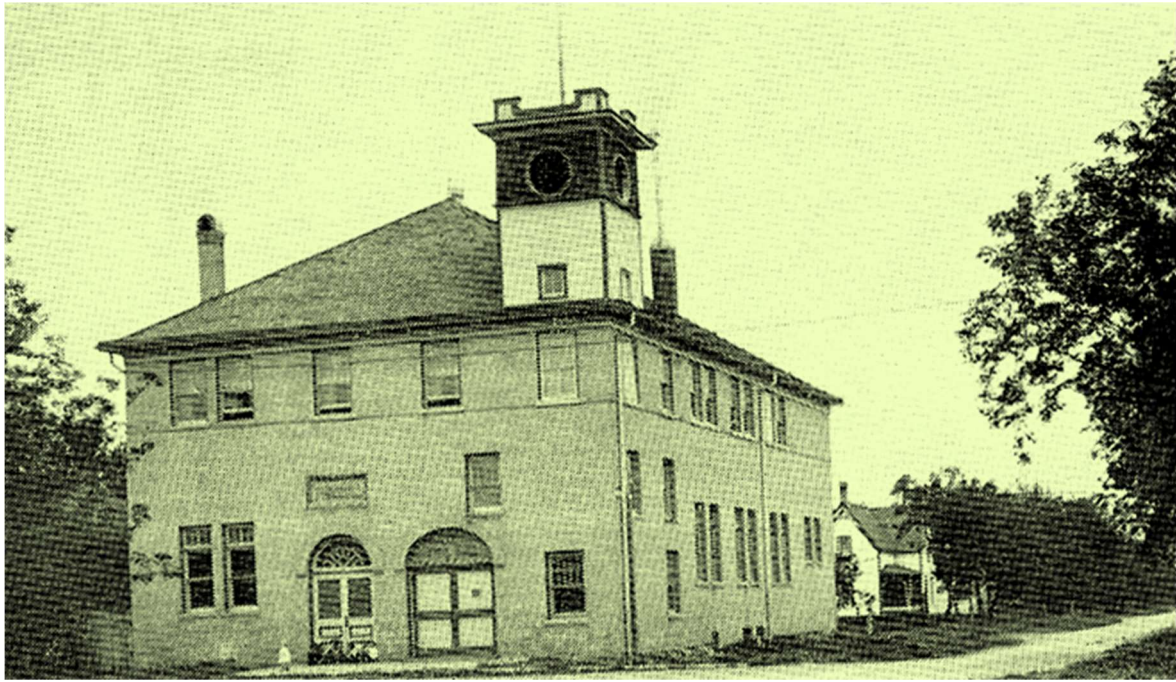
Town Hall, built in 1906.