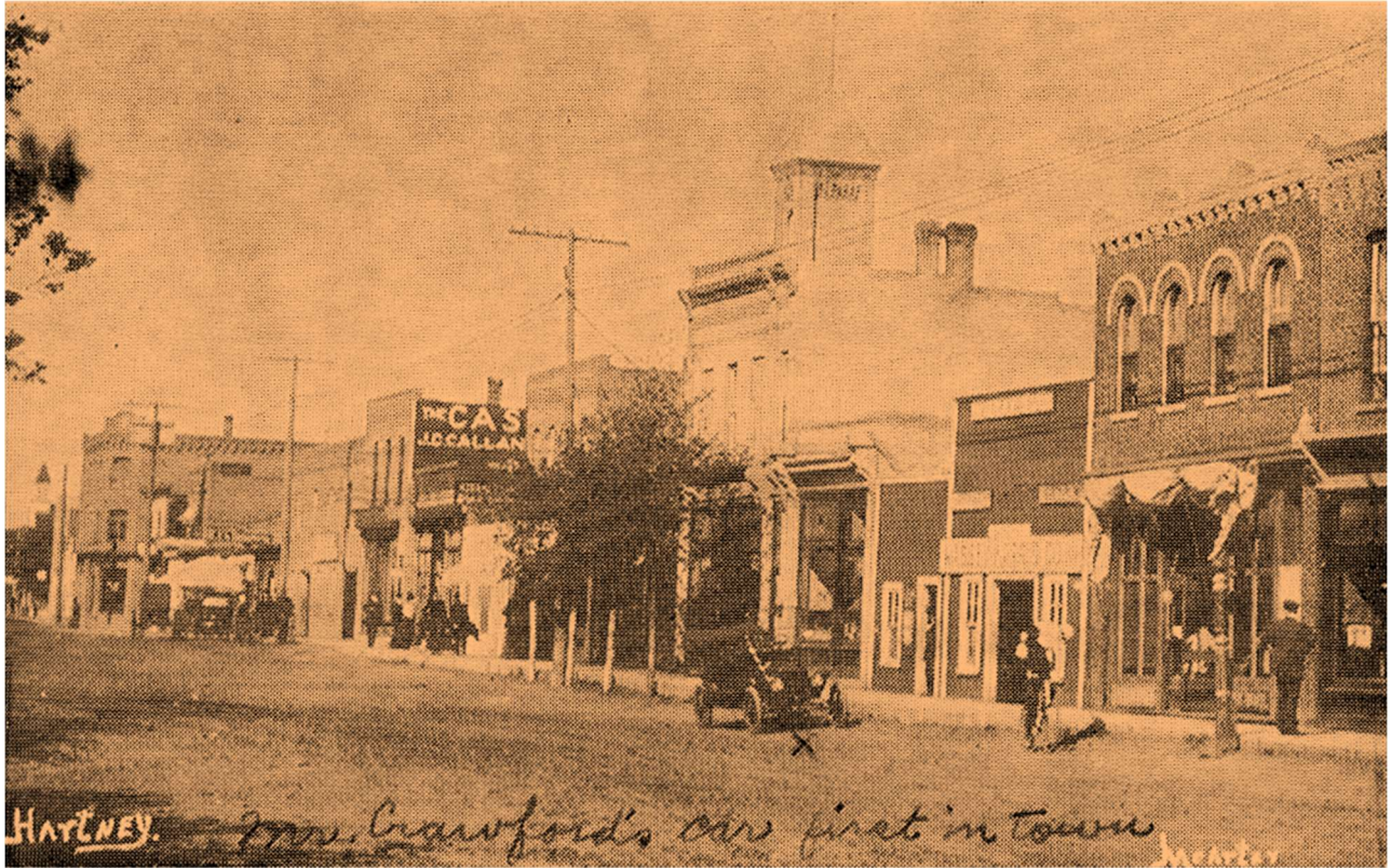
Main business block, East Railway Street. Note the car in the foreground – this is W.E., Crawford's – the first car in town in 1908.