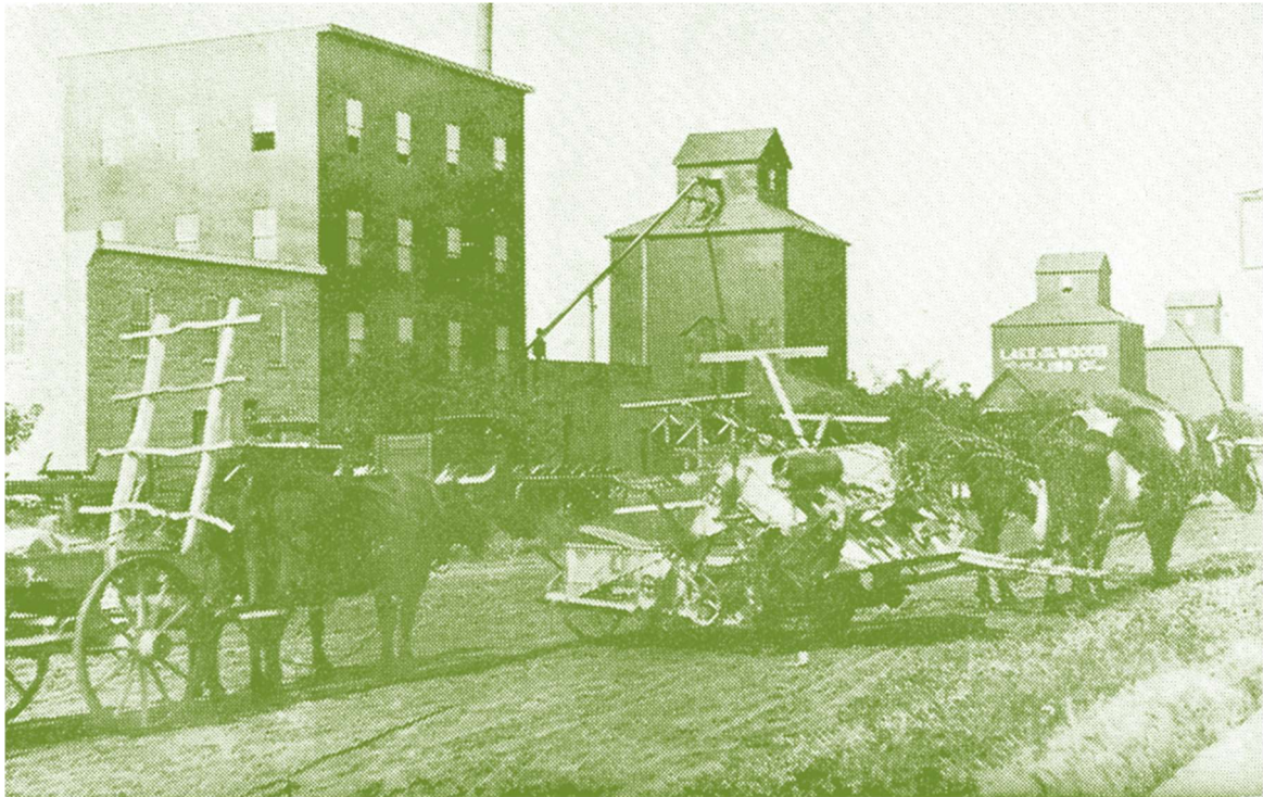
Hartney flour mill and elevators. Note the ox-drawn binder and hayrack made from poplar poles.