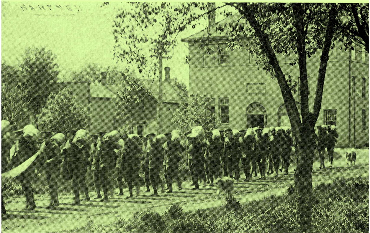
Hartney Platoon of the 222 nd Battalion marching to the CPR stations in 1916 en route to Camp Hughes and Europe, to fight in the Great War (World War I).