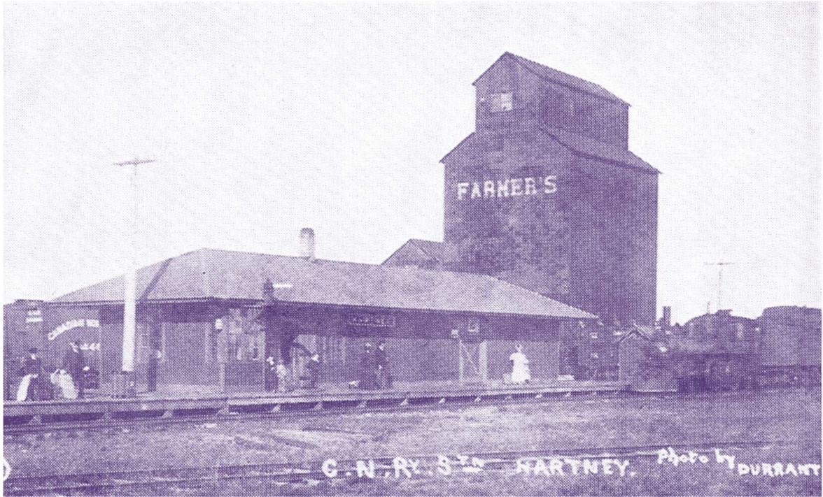
CNR Station and Farmer's Grain Elevator, ca. 1900.