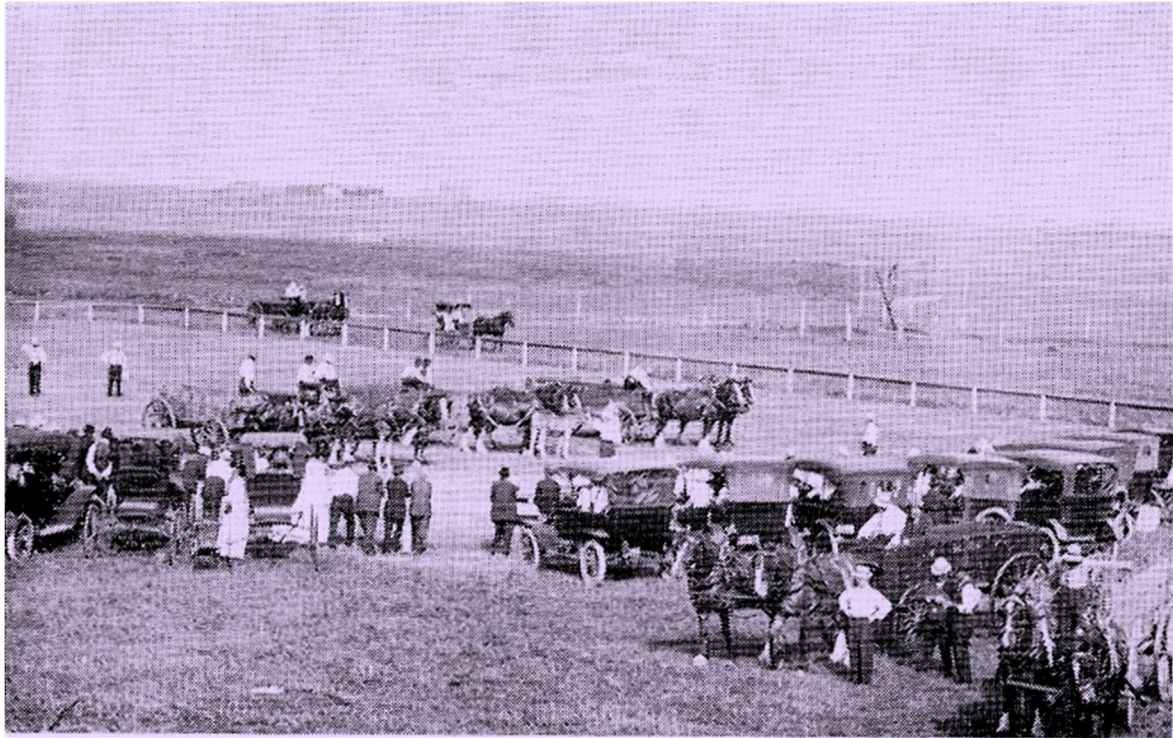
Hartney Fair, in the summer of 1910. Note the variety of transportation devices – automobiles, buggies and wagons.