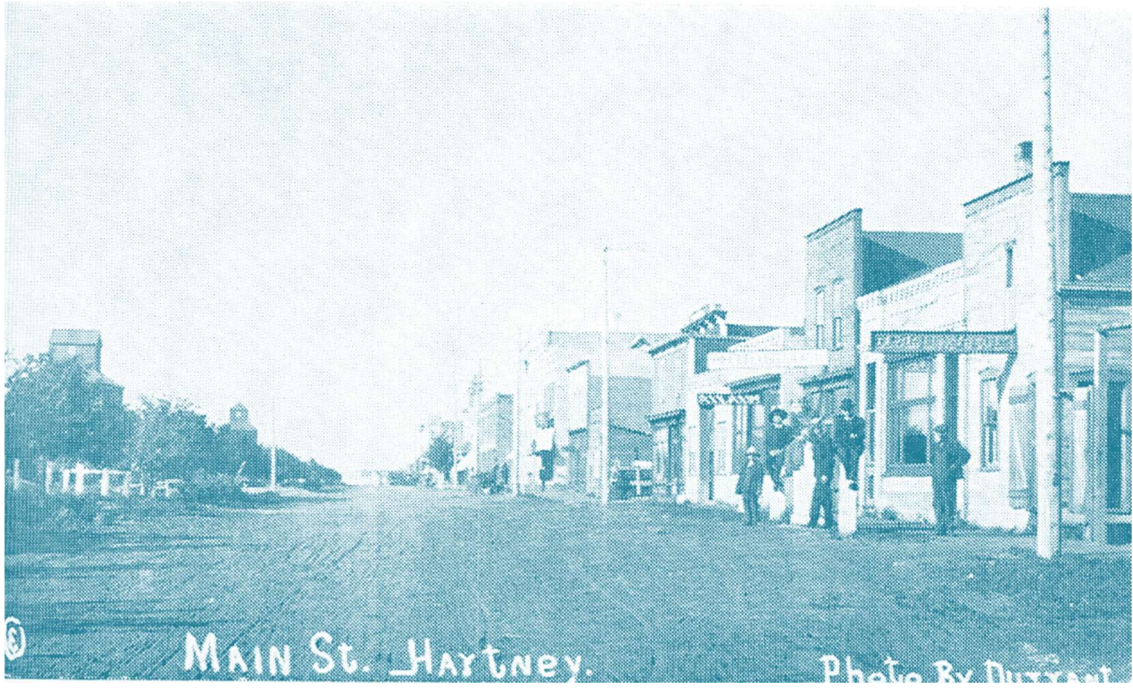
South block of East Railway looking north.