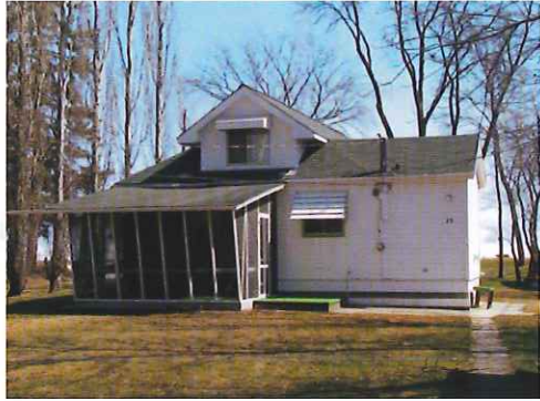
C8. Madden Cottage - 22 North Lake St. GPS loc N50 degrees 38.510 minutes W96 degrees 58.975 minutes.

The Madden Cottage, from 1910, is a reworked side-gable type of cottage, moved to this site. While of some heritage significance, the cottage is best known for its connection to noted Manitoba film maker Guy Maddin, whose movie, Tales from the Gimli Hospital , was shot here, and featured local residents and children.