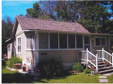
C9. Wigg Cottage - 47 North Lake St. GPS loc N50 degrees 38.615 minutes W96 degrees 58.917 minutes.

The Madden Cottage, from 1910, is a reworked side-gable type of cottage, moved to this site. While of some heritage significance, the cottage is best known for its connection to noted Manitoba film maker Guy Maddin, whose movie, Tales from the Gimli Hospital , was shot here, and featured local residents and children.